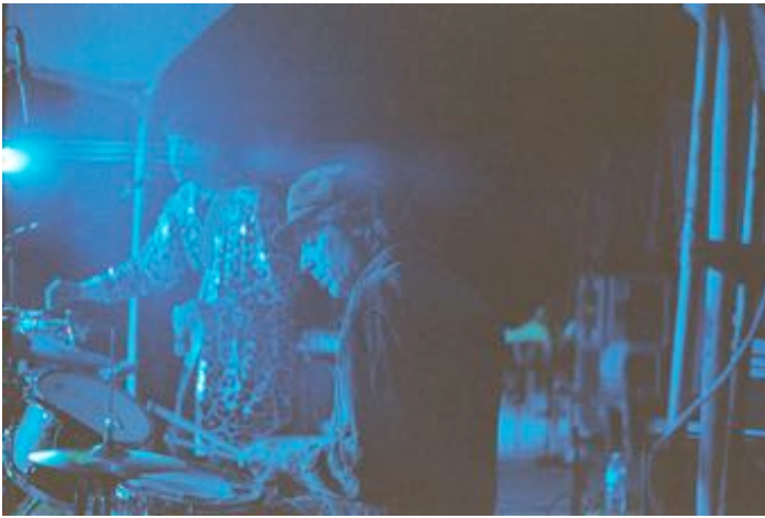
Zones at EE Festival.