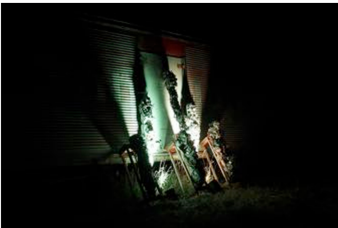
Sculptures at EE Festival.

As the sun set on the main stage, EE took the party down to a forested second stage where DJ Osound rocked dance music for ecstatic revelers until the sun rose once more.