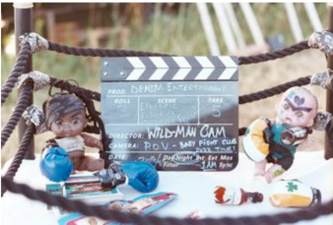
Baby Fight.

They created three dimensional shapes in the sky and swept across the audience, breaking down in time with the music. I’ve been privileged to attend a lot of festivals in my time, and I must say from a visual point of view, I’ve never seen something so impressive – it was a religious experience.