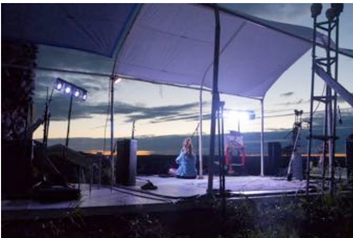
Shn Shn at EE Festival.

As you roll up the steep dirt drive to the grounds where the festival takes place, you are immediately met with breathtaking panoramic views of the valley below. The open fields where festival-goers camp are filled with all sorts of flowers, apple trees, wild garlic, orchids; it really is a little slice of heaven.