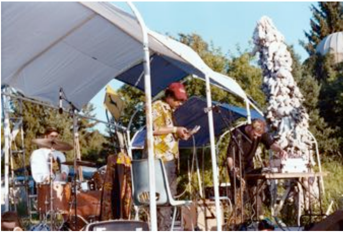
NPNP at EE Festival.

NPNP up next; the three-piece featuring modular synthesis/electronics, saxophone/mbira and drums, were thoroughly enjoyable. The drums decomposed around the steady tones, which from what I could tell, were pinned together with looping synth and mbira lines. Howling saxophone ripped through the mix.