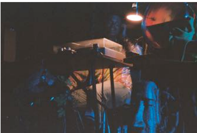
Vinyl DJ at EE Festival.

Back to the strangeness, and we were lucky to witness Baby Fight... an oddly satisfying puppet performance where the audience saw two babies wrestle to the death in front of a cheering crowd. From there the forest came to life once more with DJs until the early light once again.