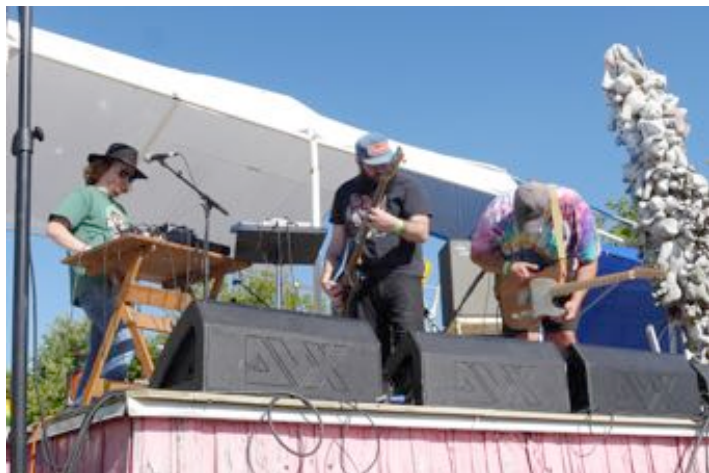
Thresher at EE Festival.

After a few hours of rest, a strong cup of coffee and some bacon and eggs, we drove into Meaford for a quick swim in the bay. The weekend was blessed with hot weather, so the water provided an essential cooldown for many of those waking up in their tent saunas. That said, the festival amenities were excellent too, with clean porta-loos (including running water), plus a cold shower for those in need of a swift refresh!