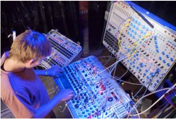
Modular synthesis installation.